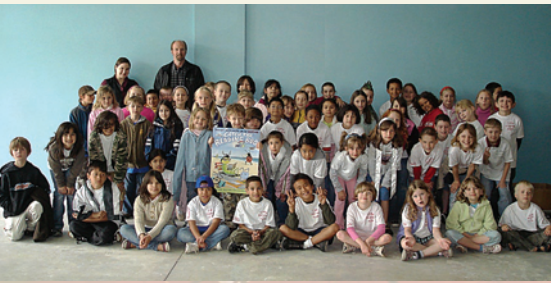
1st and 2nd Graders from Roosevelt Elementary kicked off the Bellingham Public Library's Summer Reading Program with a visit to the Barkley Branch.

We are very pleased to announce the Grand Opening of the Bellingham Public Library's Barkley branch in the Drake Building – 3111 Newmarket Street. The weeklong Grand Opening begins with the official ribbon cutting on Saturday, September 13 th . The Branch features a small in-house collection of adult, teen and children's materials. Additionally, patrons can access millions of library books, audiobooks, music CDs and DVDs available in the library catalog and have them sent to the Barkley Branch for pickup. This beautiful state-of-the-art facility also features five public Internet